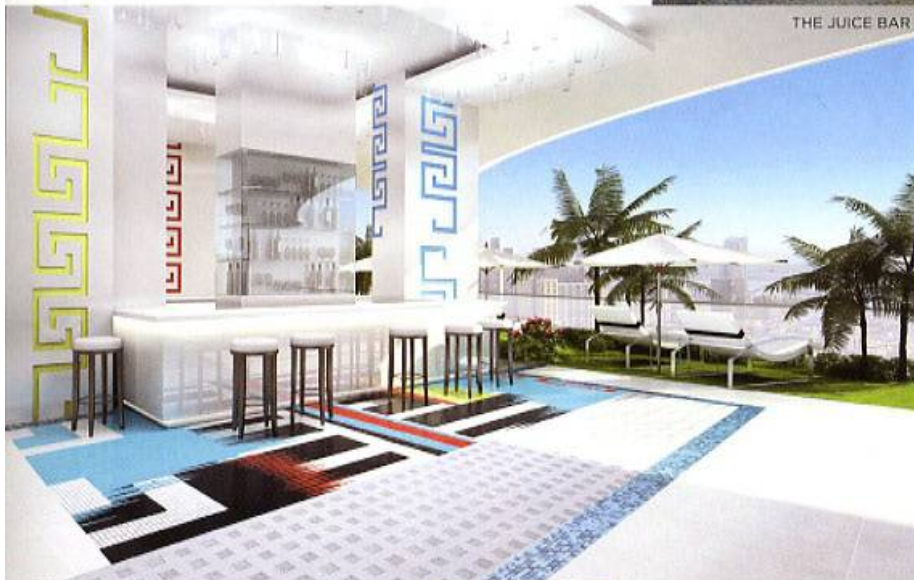
THE JUICE BAR