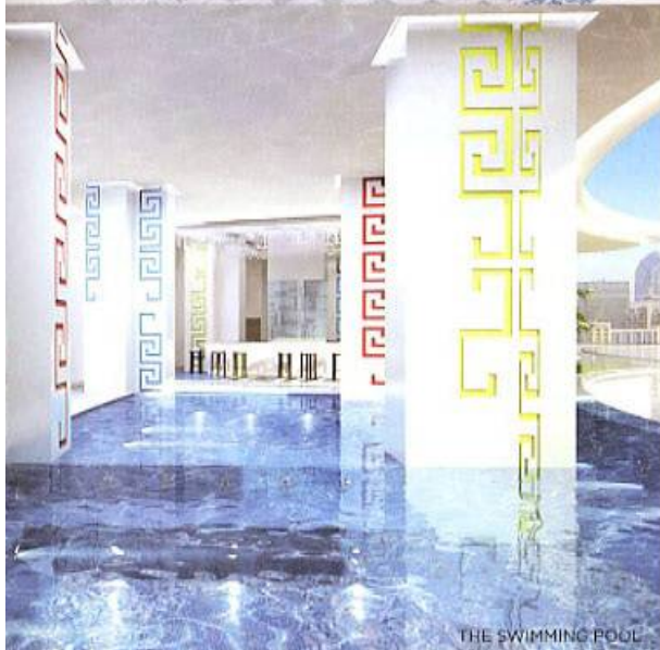
THE SWIMMING POOL

indulge in his passion for art during visits to the homes of his collector friends when he travels, which, in his line of work, is often. The last 12 months alone he has been to Europe five times, the United States twice and the Middle East three times, all for work. He has grown so used to packing his bags and jetting off to locations near and far, he considers himself a veteran traveler. There are also some regular trips the jetsetter takes every year, including the Art Basel Fair (both in Switzerland and